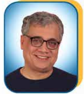
Shri Derek O'Brien